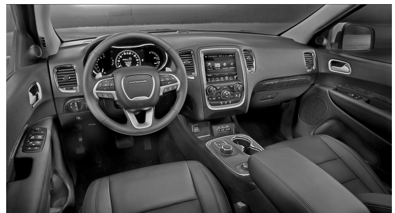
All Durango models feature the latest award-winning class-exclusive Uconnect Touchscreen technology and enhanced comfort and convenience features such as class-exclusive seatback-mounted Dual Screen Blu-Ray / DVD Players, Forward Collision Warning with full-stop functionality and heated and ventilated Nappa leather seats. PHOTO COPYRIGHT 2013 CHRYSLER GROUP LLC.

The new 2014 Dodge Durango competes in the fastest growing segments in the U.S. auto industry, the full-size SUV and crossover segments, which combined are up nearly 50 percent