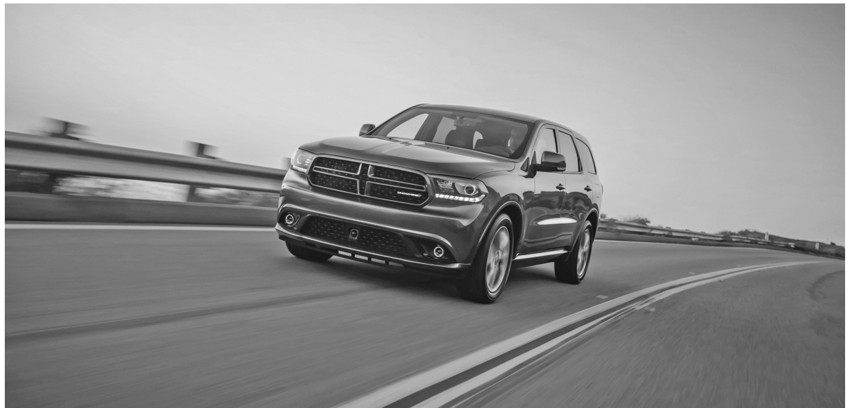
The 2014 Dodge Durango, the ultimate "No Compromise SUV," will start arriving in dealer showrooms at the end of the third quarter with a starting U.S. Manufacturer's Suggested Retail Price (MSRP) of $29,795.